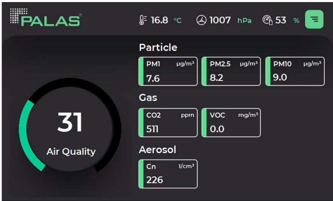
Fig. 3: AQ Guard screen view

Auxiliary sensors for CO 2 and volatile organic carbohydrates (VOC) built into AQ Guard provide data for calculating an indoor air quality index (AQI) according to the European model. AQ Guard also records air temperature, pressure and relative humidity.