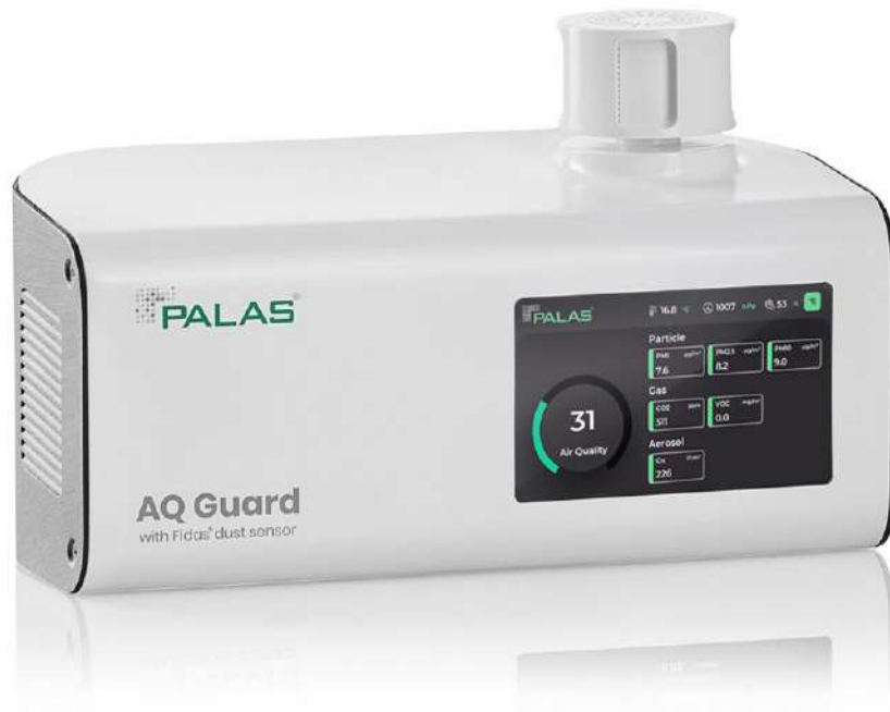
Fig. 1: AQ Guard

AQ Guard, currently the most advanced compact analyzer for determining indoor air quality, continuously and reliably analyses airborne fine dust particles in the range 175 nm – 20 μm (*) IAHP-Package starting from 150 nm). A newly developed mass conversion algorithm calculates PM values based on single particle optical light scattering, taking signal duration and shape into account. Sensor system and algorithms were developed based on the technology of the EN 16450 certified Fidas® 200. The "Ambient" version (with heated aerosol inlet) achieves precision comparable to type approved analyzers, which makes AQ Guard stand out compared to similar devices.