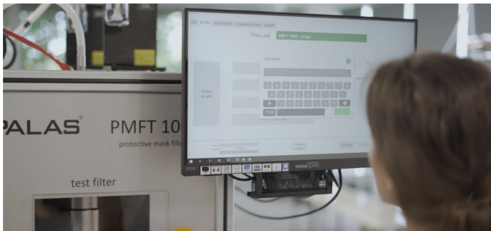
Figure 2: Test stand PMFT from Palas