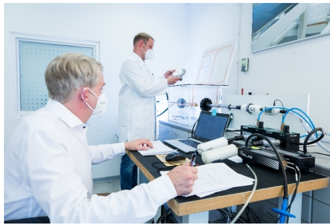
Figure 1: Transmittance test bench TÜV NORD (measuring chamber with Palas photometer Welas®)

The aim: to ensure that the measurement results of the PMFT 1000M test stand (Palas GmbH) are comparable to those of a notified body (EN 149 compliant test). The PMFT is used by mask producers for quality assurance.